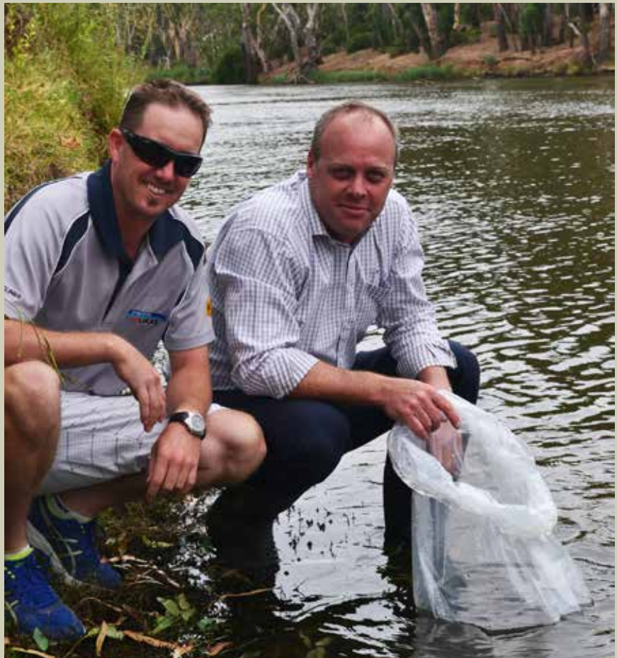
Murray cod fingerling release.

Fish stocking is recognised for its importance to the community in terms of providing quality recreational fishing, conservation outcomes and employment opportunities, as well as assisting in reversing the impacts of introduced species to the natural waterways.